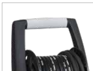
ROBUST AND ERGONOMIC HANDLE