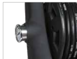
PROFESSIONAL GAUGE (only for I1508 A0-M - I1610 A0-M)