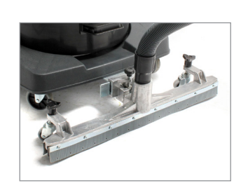
OPTIONAL FIXED ACCESSORY